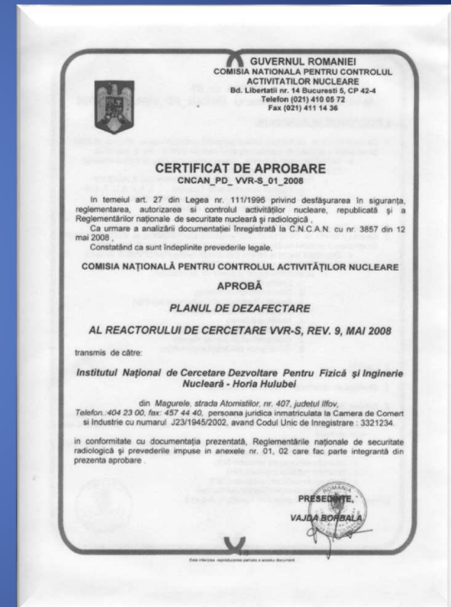
CNCAN approval of DP version 9