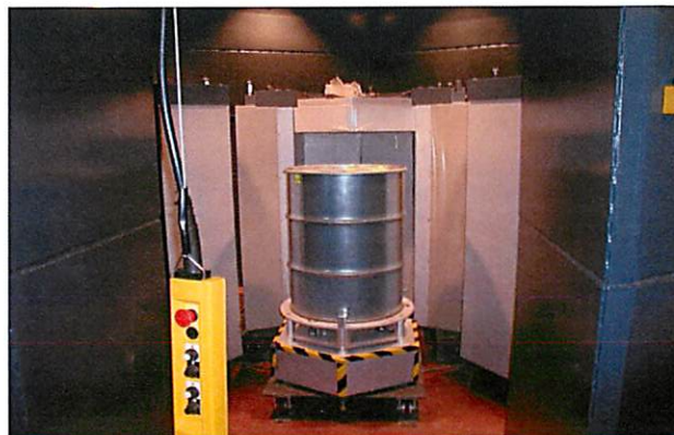
Non destructive techniques