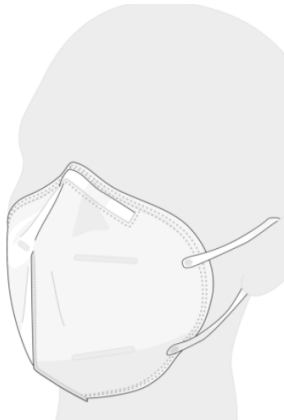
Fig 1: Example of a FFP2 mask ( FH Munster ).

FFP2 masks have different shapes and straps. You can see below an example of FFP2 mask: