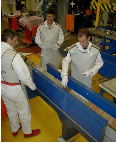
FIG. 2. Building of a fissile tube