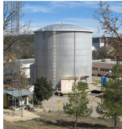
FIG. 1. The MASURCA zone (left) and the reactor building (right)