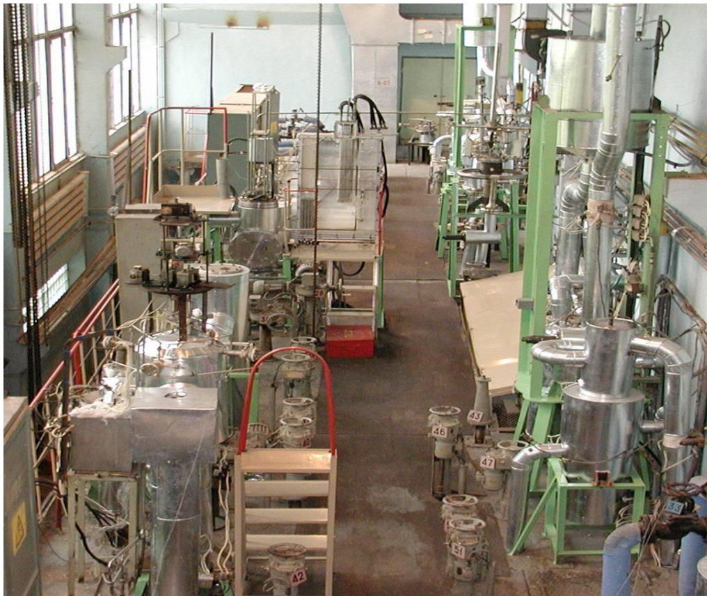
FIG. 2. The overall view of the liquid metal test facility "6B"