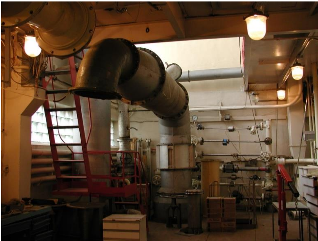
FIG. 1. View of the SGDI facility hall