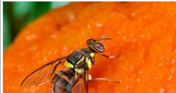
Bactrocera dorsalis

The Fruit fly Integrated Pest Management project, funded by the European Commission, shows resilience and innovation during Covid-19 times. Despite the obstacles, FF-IPM's researchers managed to produce high-quality results and held virtual meetings and workshops. Read more