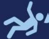
SLIPS TRIPS & FALLS